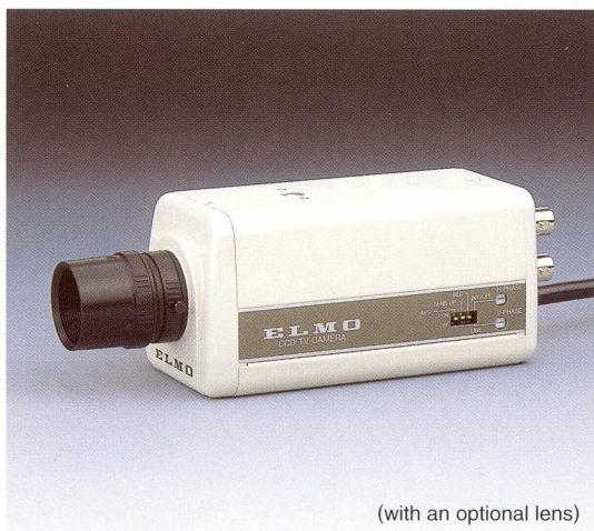
(with an optional lens)