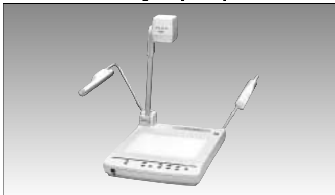
High-Resolution Visual Presenter, HV-5500XG XGA resolution of 1/3" 850,000 pixels CCD